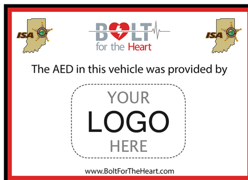
Sample Window Cling

Every donor who pledges an AED ($1,595) will have their "Company Logo" (or) their "Name" proudly displayed on a 5"x7" window cling, in the back window of the patrol vehicle that your AED was purchased and placed in.