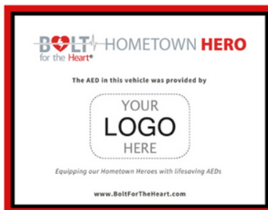
Sample Window Cling

Each donor who pledges $1,795 towards our Hometown Hero program can have their (company logo) or (name) displayed on a 5"x7" window cling in the back window of a patrol vehicle.