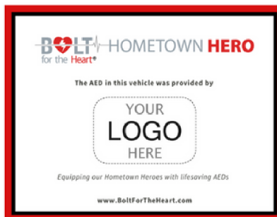
Sample Window Cling

Each donor who pledges $1,795 towards our Hometown Hero program can have their (company logo) or (name) displayed on a 5"x7" window cling in the back window of a patrol vehicle.