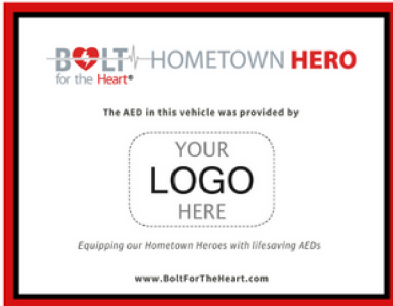
Sample Window Cling

Each donor who pledges $1,795 towards our Hometown Hero program can have their (company logo) or (name) displayed on a 5"x7" window cling in the back window of a patrol vehicle.