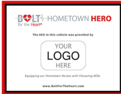
Sample Window Cling

Each donor who pledges $1,845 towards our Hometown Hero program can have their (company logo) or (name) displayed on a 5"x7" window cling in the back window of a patrol vehicle.